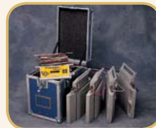
PT Axle Weigher Indicator with PT300-LI pads and carrying case