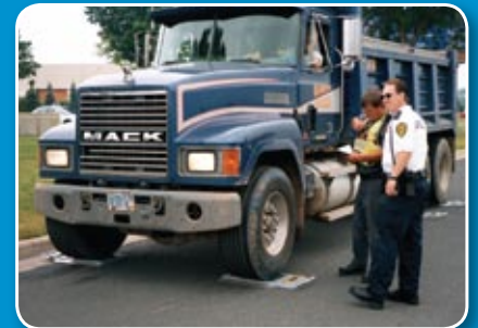
Low Profile 1.5" Scales for Easy On/Off Loading