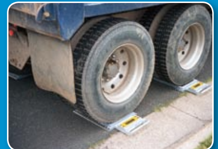
Large Platform to Accommodate Dual Wheels

Uses portable scales with on board wireless transmission to handheld computer