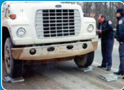
Heavy Duty 3" Scales for All Surfaces